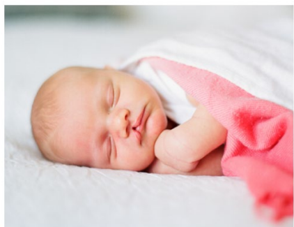
Cleft Registry and Audit Network Database Part of the Clinical Effectiveness Unit, of the Royal College of Surgeons of England